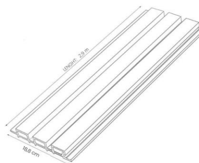
STANDARD SLATTED CLADDING BOARD 188 x 23,5 mm